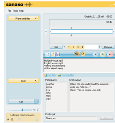
Student Main Window