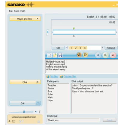
Student Main Window