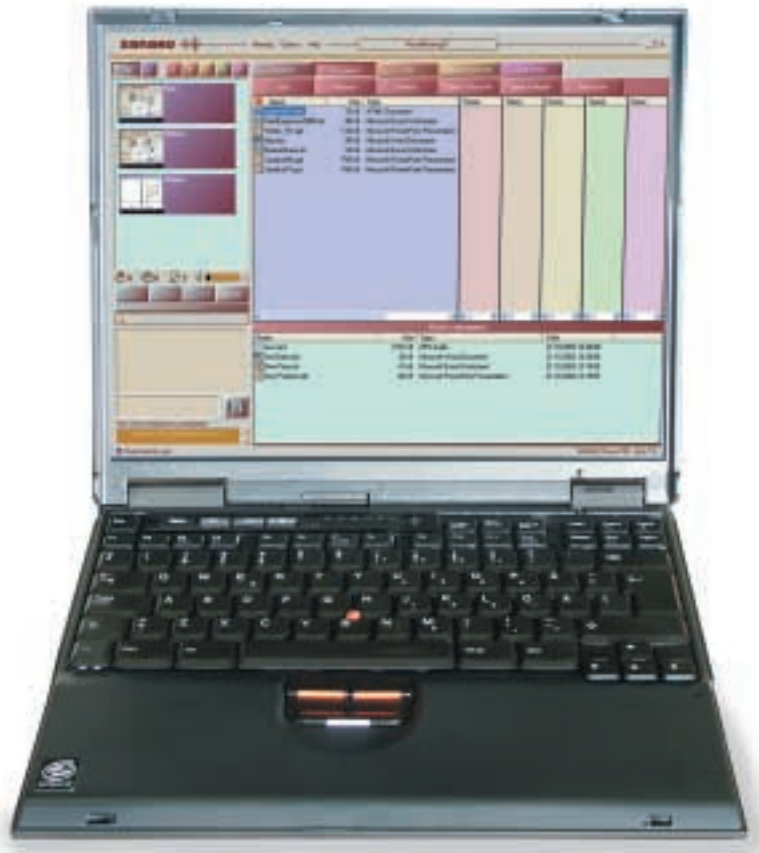
SANAKO Forum 100 Host Software

Sanako Forum 100 has a dedicated audio server, the Sanako Communication Server, which guarantees the highest quality audio possible. Simply 'Plug & Play' the Forum 100 server to your network. Other necessary system components can be installed on one or more of your existing file servers.