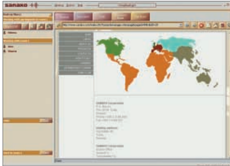
SANAKO Forum 100 Participant Software

In the Forum 100 meeting, a host, or a participant acting as Presenter, can guide other participants to websites on the Internet, saving time and avoiding confusion. Additionally, the host, or any participant acting as Presenter, can run presentations* including documents, PowerPoint presentations and worksheets from their own user interface, while simultaneously making comments. As in a typical meeting room situation, the other participants can follow the presentation in progress without having to operate any controls.