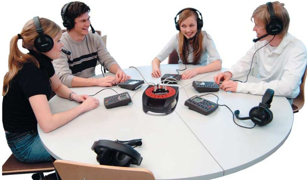
The dual-purpose cable spool in the Lab 100 cart can be used to attach student UAPs, and neatly and easily winds up cables for storage once the class is over.