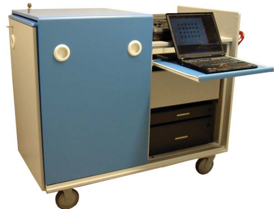
The versatile SANAKO Lab 100 digital language center now also available in a mobile version.

No longer do students have to move to a separate location for language learning activities because this language-teaching environment moves to them! SANAKO Lab 100 language lab on wheels is easy to set up and take down, and no separate language lab location is needed as the Lab 100 portable system provides teachers with innovative and stimulating tools for language learning - anywhere! The Lab 100 cart can be used in classrooms with or without fixed cabling, making it a flexible option for any environment. The sturdy cart also provides storage space for the User Audio Panels and student headsets - it's a compact lab-on-wheels!