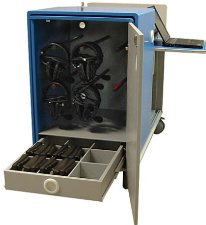
With ample storage space for student User Audio Panels and headsets, the SANAKO Lab 100 cart system is completely portable!

The Lab 100 cart allows for connections of 5 User Audio Panels to one cable spool at the same time. It means that for every 5 students, there is only one cable to be connected to the lab on wheels. This handy solution reduces the amount of wiring needed for student positions, and also reduces the storage space needed. That's one reason why an entire 30 student-position language classroom can be stored in a single cart! This makes it easier for teachers to accommodate smaller or larger language classes as needed.